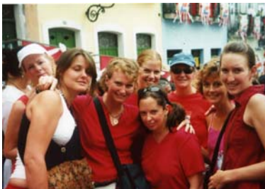
Below: The Bahia Street 2005 Study Tour