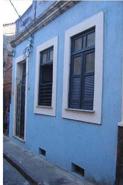
Above, and right: The girls at the new Bahia Street Center in Salvador, Bahia, Brazil.