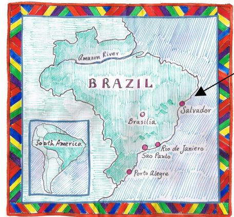
Salvador is a city in the northeastern state of Bahia

Bahia Street helps these children and their families by providing a high quality education. There are 60 girls in the program, and every day they go to the Bahia Street Center for a half-day. Here they are provided with an academic program on par with the best private schools in the city. At the Bahia Street Center, they can take showers and eat a hot meal. The girls also go to public school for a half-day, where they often help the other students by using what they have learned at the Bahia Street Center.